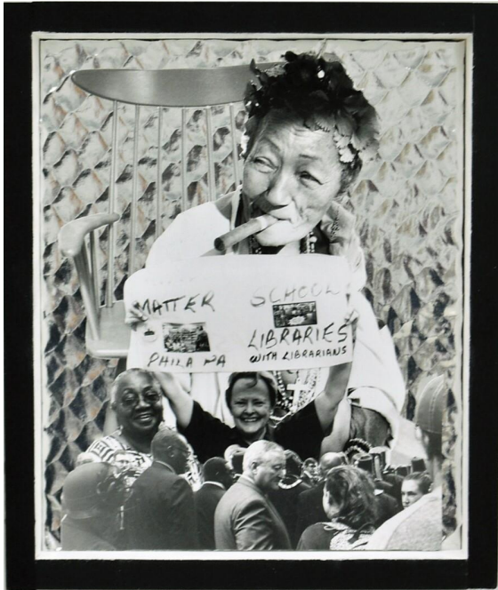
Ancestral Fiber, 2017, silver gelatin, acrylic, paper, chicken wire, and wood. 12" x 14"

I currently serve as lecturer in African and African American Studies at Arizona State University in the School of Social Transformation. I hold a bachelor's degree from SUNY Buffalo State College '09, a master's degree from Columbia University, and an MFA degree from Moore College of Art and Design.