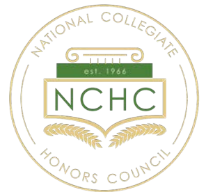
NCHC 2023: Chicago Pg. 2