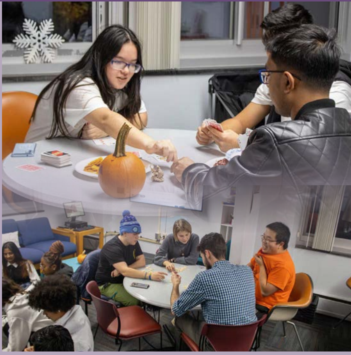
Honors Entrepreneurs Pg. 3