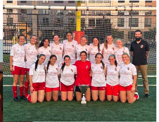
Hudson Valley Crusaders