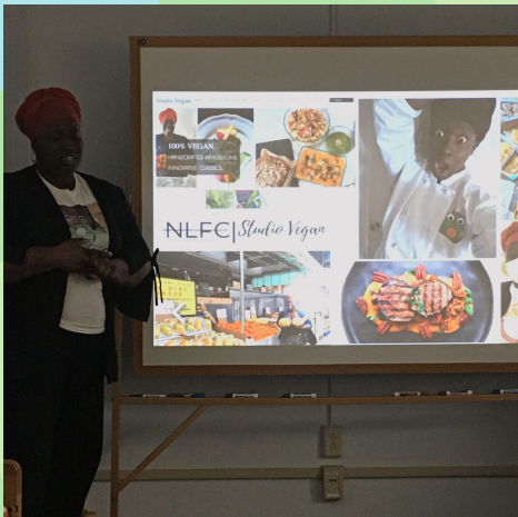
Eco-Friendly Eating with Studio Vegan