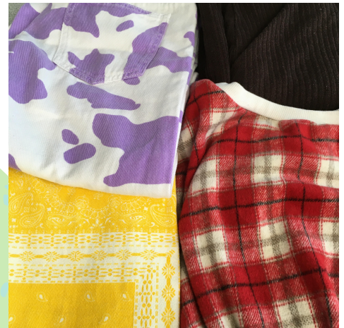
Clothing Swap in the Honors HUB