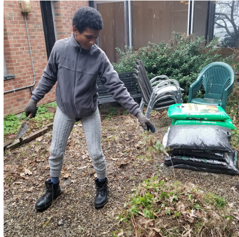
South Wing Courtyard Beautification